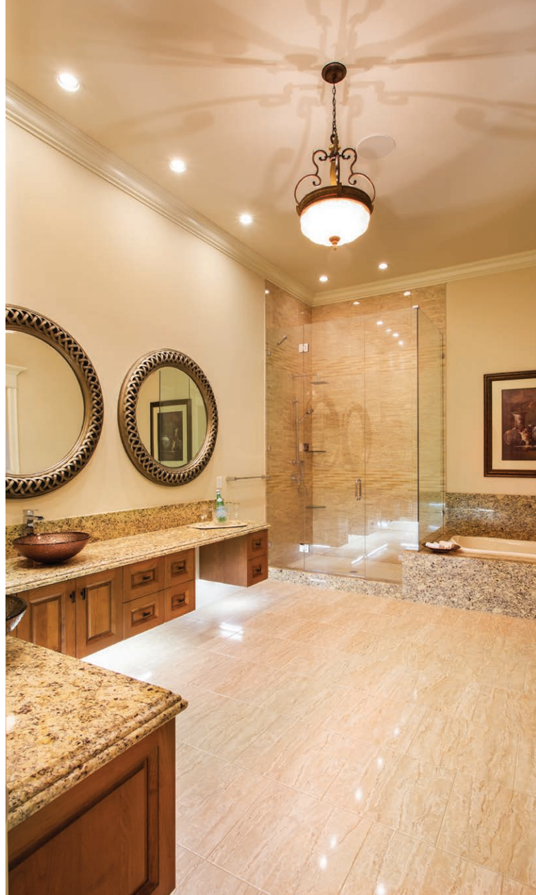
↑ The huge master en suite is sheathed in pale, soothing blond tile and marble.

3,000 pounds of furnishings from Misty's Consignment in Rancho Mirage, California.