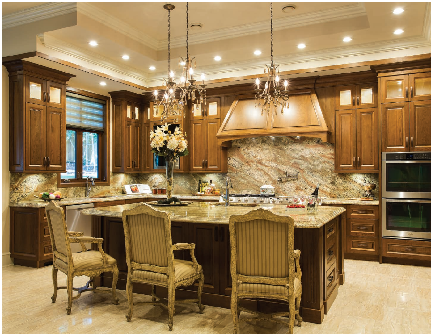
↑ The granite island and built-in circular table have double bullnose edging, approximately 1.5 inches thick, giving it substantial heft. The color, neptune bordeaux, offers multiple variations and color strains.

“We’ve been blessed with having lived in more than one beautiful home,” says Brenda, adding she is humbled by her good fortune.