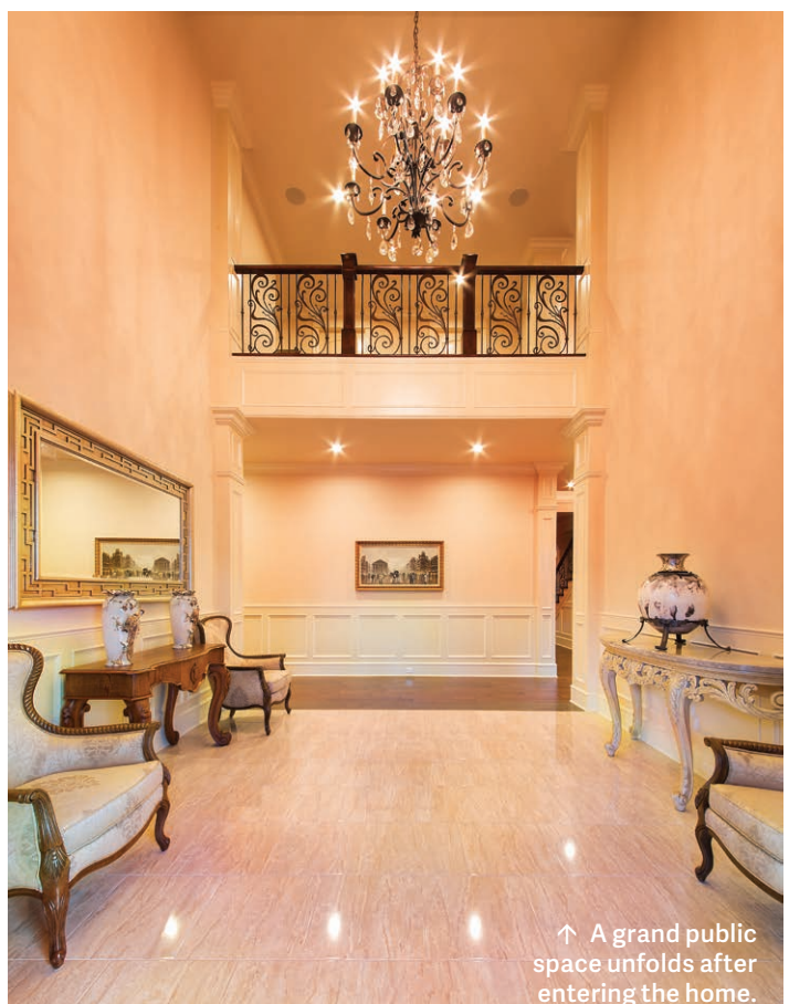
↑ A grand public space unfolds after entering the home.