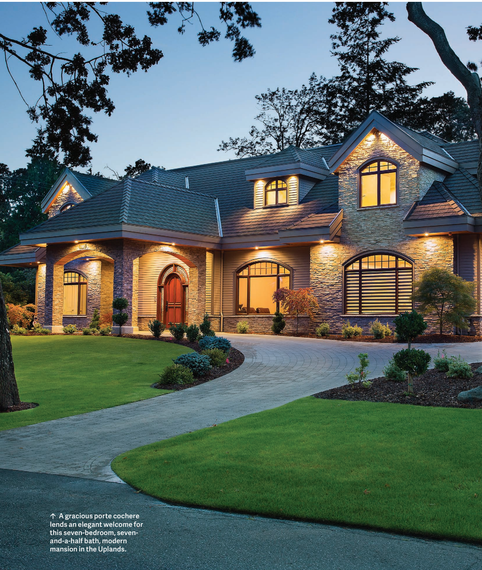
↑ A gracious porte cochere lends an elegant welcome for this seven-bedroom, seven-and-a-half bath, modern mansion in the Uplands.